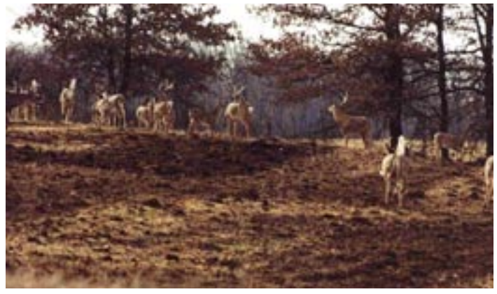
HEALTHY HERD. By practicing proper herd management techniques, landowners can produce quality trophy animals, like those seen here at Base Camp Leasing.