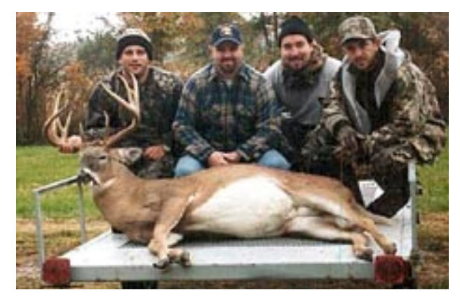
IN THE BAG. Successful clients of Base Camp Leasing, proudly display a big bodied 12 pointer that was harvested during the 2002 Indiana Archery Season.

For more information about the benefits of leasing your land or your hunting rights, contact Steve Meng at Base Camp Leasing at <a href="www.basecampleasing.com">www.basecampleasing.com</a> or e-mail <a href="info@basecampleasing.com">info@basecampleasing.com</a> or call 1-866-309-1507.